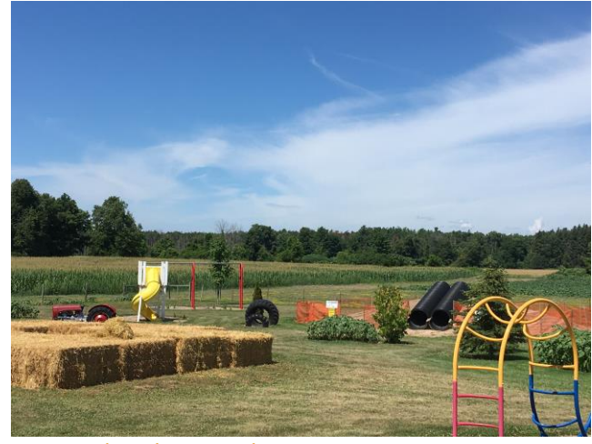
Your adventures start here! Create lasting memories, snap some pictures, and enjoy the farm ambiance that awaits you!

Some new protocols include: Registered sign-in/sign out at entrance to park. Social distancing while in park. Please use our facilities and wash or sani hands often. We remind parents to supervise their children at all times. Thank you for understanding.